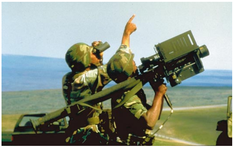
Reliable C4I capability is required to detect, identify, and track threats to warn and cue defensive assets.

architecture provides the timely intelligence and operational information needed to plan, employ, coordinate, deconflict, execute, and sustain joint counterair operations. Effective C4I systems help commanders fuse geographically separated offensive and defensive operations into a focused effort. These systems also facilitate the integration of counterair with other joint operations via rapid communications among commanders, staffs, sensors, weapon systems, and supporting agencies.