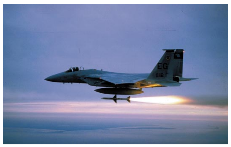
Air superiority is essential for the success of most military operations.

The degree of control may vary from air supremacy to local air superiority, depending on the overall situation and the JFC's concept of operations. It may be needed for different lengths of time, ranging from a few minutes to the duration of the conflict, and also vary with geographic areas. The JFC normally seeks to gain and maintain control of the air environment as quickly as possible to allow friendly forces to operate without prohibitive interference from enemy air threats. US military forces must be capable of countering the air and missile threat from initial force projection through redeployment of friendly forces. These threats include enemy aircraft (manned or unmanned), ballistic missiles, and