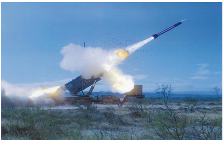
Joint counterair integrates capabilities from all components.

b. Defensive Counterair (DCA). DCA is all defensive measures designed to detect, identify, intercept, and destroy or negate enemy forces attempting to attack or