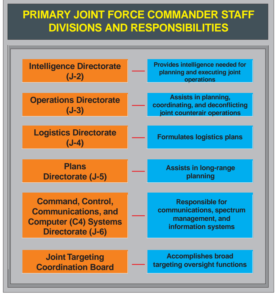
Figure II-1. Primary Joint Force Commander Staff Divisions and Responsibilities

quickly as possible. J-2 will operate the joint intelligence center or joint intelligence support element, as appropriate, for the JFC. J-2 ensures that the intelligence needs of the command and subordinate commands are met.