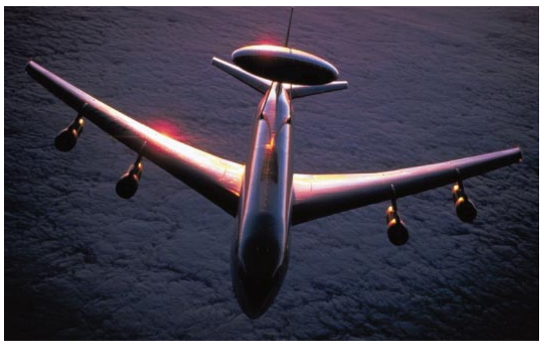
Successful counterair operations require coordination, integration, and deconfliction with other component operations.

A joint air operations center (JAOC) normally functions as the JFACC's principal operations center. It links with national and theater sensors, intelligence, communications, and component operations centers. The success of the JAOC rests on the expertise of component liaisons such as the battlefield coordination detachment, naval and amphibious liaison element, Marine Liaison Officer, and the special operations