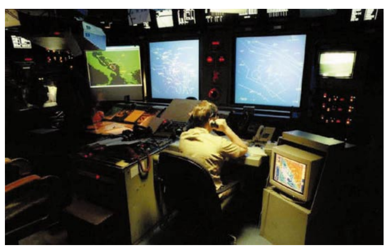
Airspace control integrates different airspace users and provides them with responsive and timely support.

Standardized airspace control procedures and close coordination reduce confusion and contribute to the overall effectiveness of the counterair mission. The ACA recommends and JFC approves the boundaries within which airspace control is exercised and provides priorities and restrictions regarding its use. Coordination with host nation active DCA systems is essential.