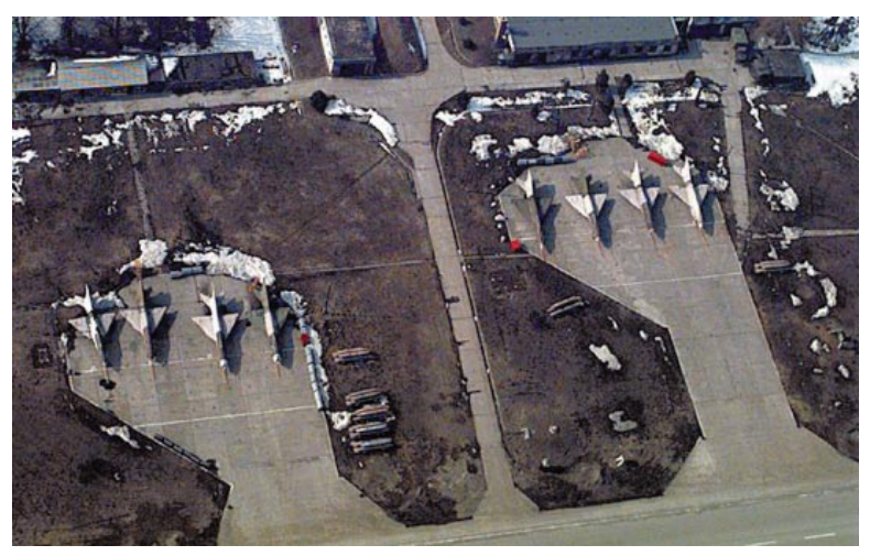
Attacking OCA targets as close to their source as possible reduces the risk of air and missile attacks.

a. Airfields and Operating Bases. Destruction of hangars, shelters, maintenance facilities, and other storage areas as well as petroleum, oils, and lubricants will reduce the enemy's capability to generate aircraft sorties. Runway or taxiway closures often prevent use of the airfield for short periods, thus preventing subsequent takeoffs and forcing returning aircraft to more vulnerable or distant locations. Direct attacks on crews and maintenance personnel facilities may reduce