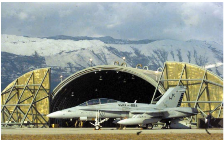
Rapid proliferation of theater missiles expands the scope and complexity of protecting friendly forces and vital interests.