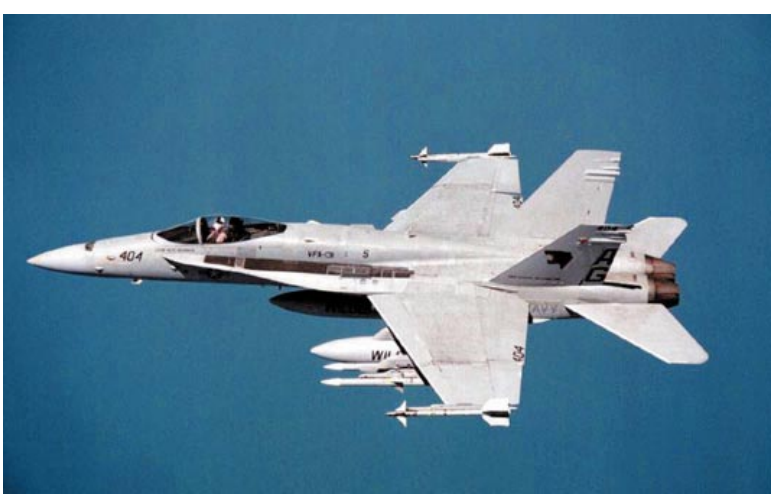
Fighter aircraft may perform a fighter sweep to seek out and destroy enemy aircraft or targets of opportunity.