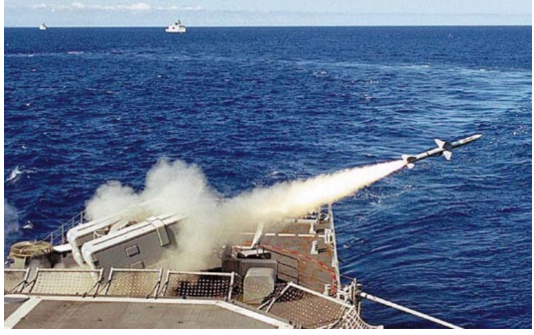
Successful active air defense requires the integration of all appropriate defensive forces and weapon systems within an AOR and/or JOA.

component capabilities and/or forces to the AADC to support theater- and/or JOA-wide DCA operations. The JFC determines the most appropriate command authority over forces made available, but normally air sorties are provided TACON, while surface-based active defense forces are provided in direct support. Regardless of the command relationship, all active defense forces made available are subject to ROE, airspace, weapons control measures, and fire control orders established by the AADC and approved by the JFC. As the supported commander for theater- and/or JOA-wide DCA, the AADC will be granted the necessary command authority to deconflict and control engagements and to exercise real-time battle management.