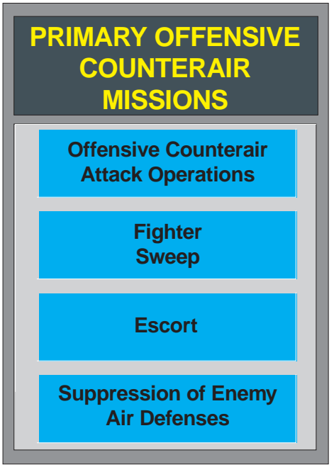
Figure IV-1. Primary Offensive Counterair Missions

a. OCA Attack Operations. These attack operations are offensive actions against surface targets which contribute to the enemy's air power capabilities. The objective of attack operations is to prevent the hostile