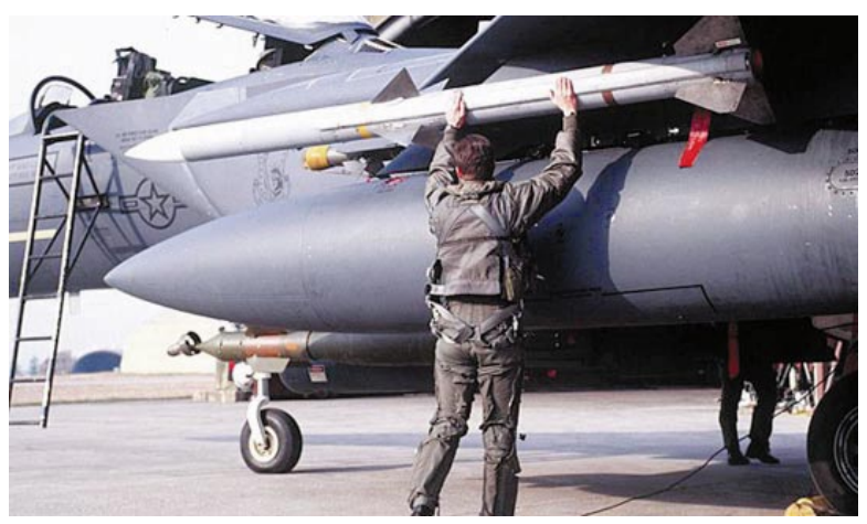
Active air defense assets include fixed- and rotary-wing aircraft.

The overall DCA effort should be centrally planned and should integrate forces and capabilities from all components. The JFC defines missions and may apportion